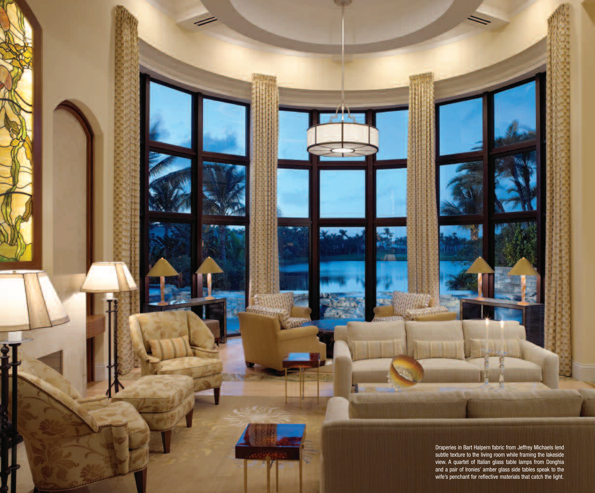
Draperies in Bart Halpern fabric from Jeffrey Michaels lend subtle texture to the living room while framing the lakeside view. A quartet of Italian glass table lamps from Donghia and a pair of Ironies' amber glass side tables speak to the wife's penchant for reflective materials that catch the light.